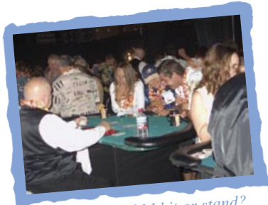
Hmmm...should I hit or stand?

On August 28, 2004, more than 140 guests joined the CATS Meow Guild for the 2 nd annual Casino Night. Hosted and 100% underwritten by Meissner Manufacturing Co., Inc., the evening was a Hawaiian Style affair to remember. Activities included Black Jack, Craps, Roulette, Every Hour on the Hour Drawings, Live Entertainment, a Silent and Live Auction and appetizer and dessert buffets to die for. Guests savored Mai Tai Madness while bidding on items ranging from vacation packages to helicopter rides. Once again, Casino Night was a huge success.