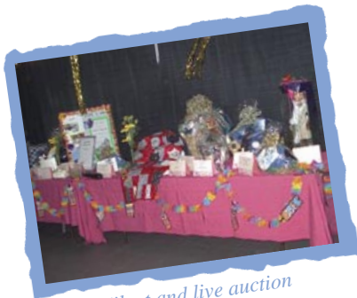
Silent and live auction items aplenty!